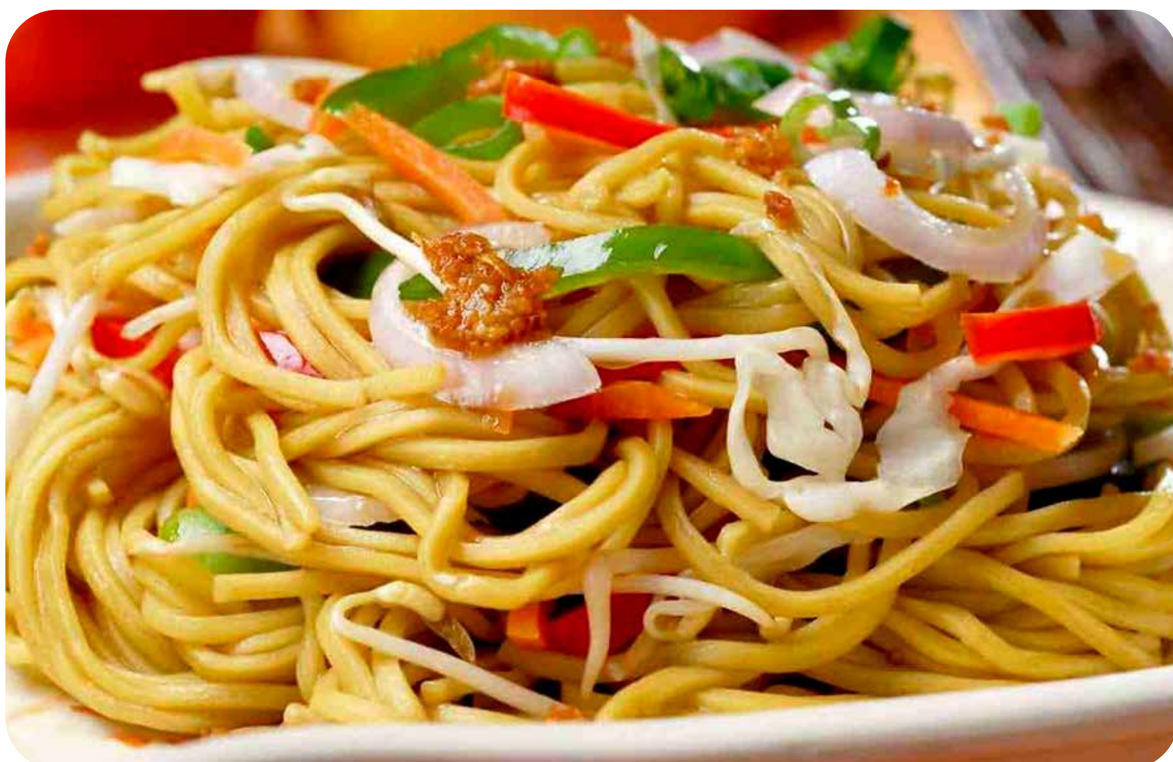
Hakka Noodles - Veg / Chicken / Mixed