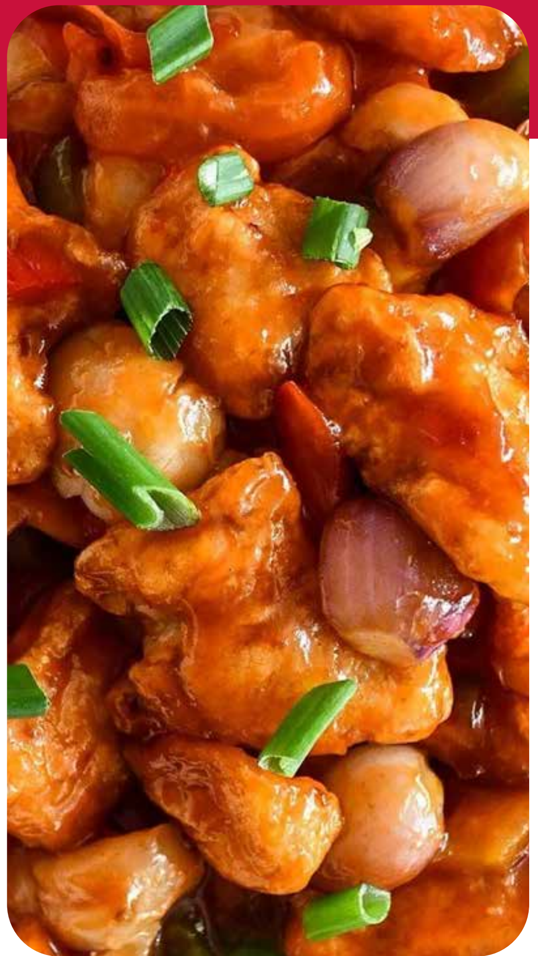
Sweet 'n' Sour Fish