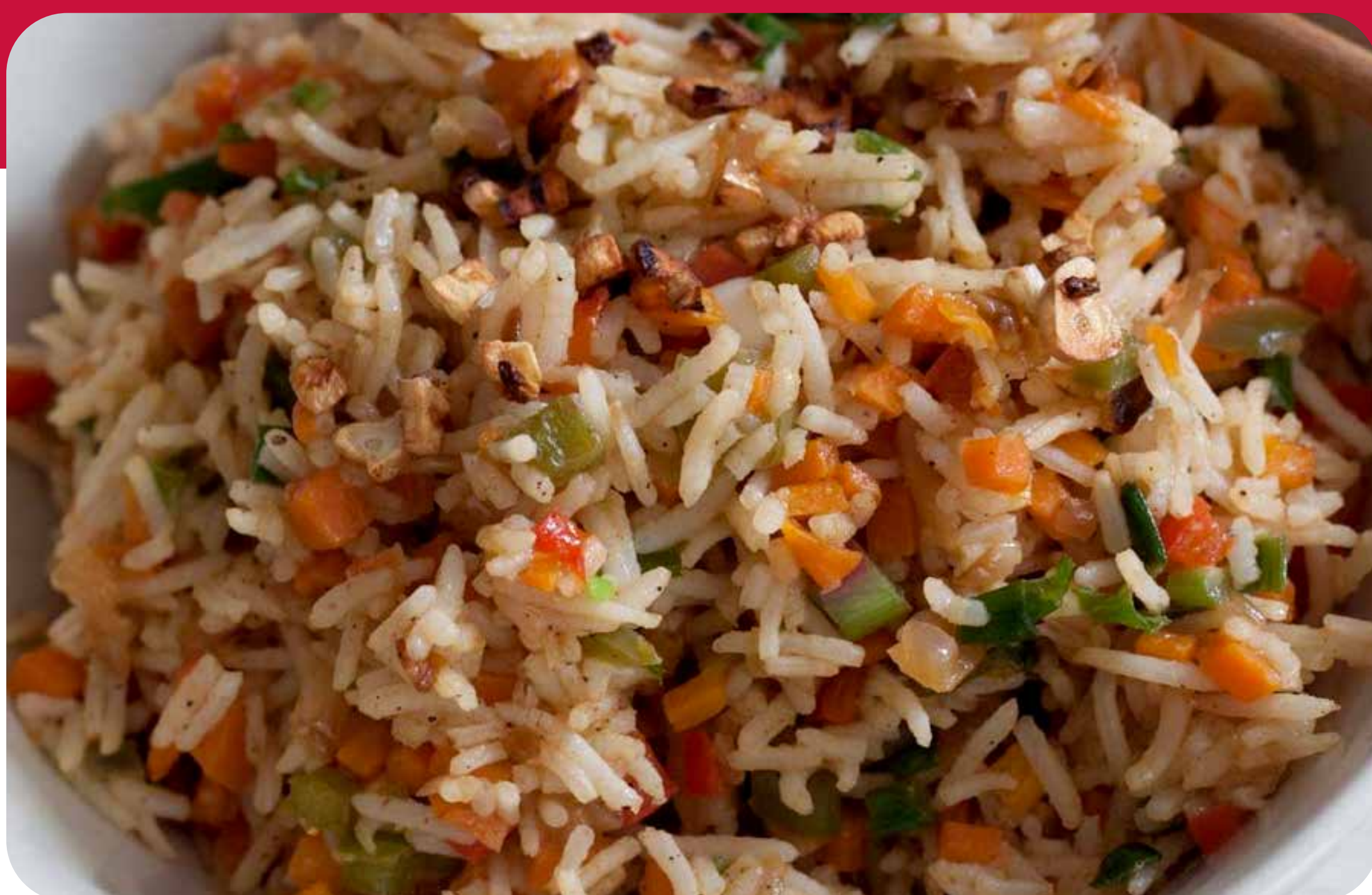
Burnt Garlic Fried Rice