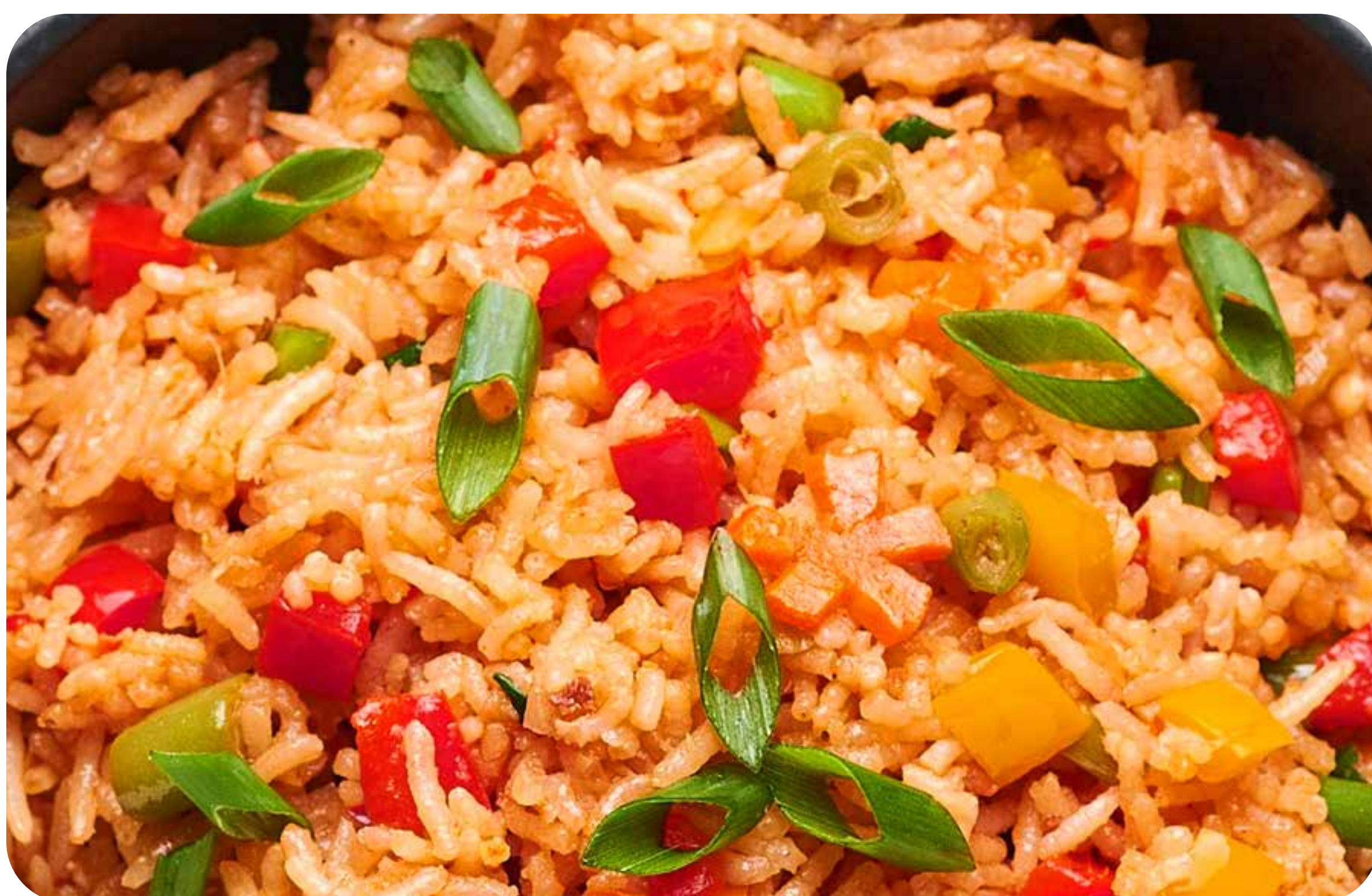
Schezwan Fried Rice