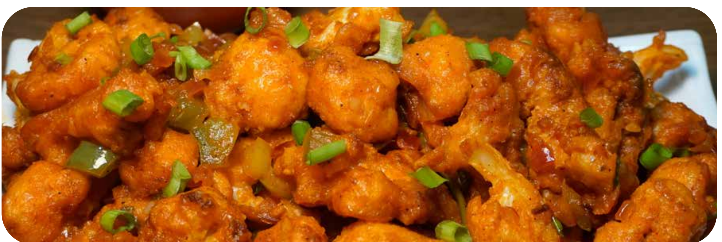
Gobi Manchurian Dry